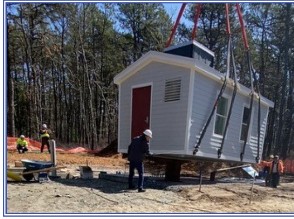
Mary Dunn 4 Well building delivery and placement.

In 2024 the Hyannis Water System's capital improvements included the installation of a new water main toward the South-end of Ocean Street and commenced construction of the Mary Dunn 4 replacement well. The design of the Straightway Treatment Plant was finalized as was the design for the Mary Dunn transmission main.