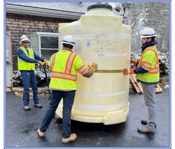
The exchange of a chemical tank at the Hyannis Port Treatment Plant in Hyannis